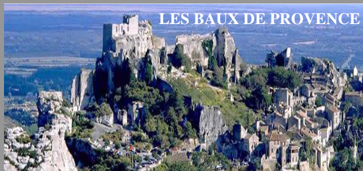
LES BAUX DE PROVENCE