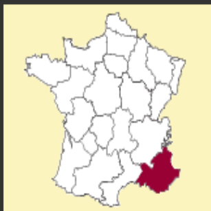
MAP OF FRANCE