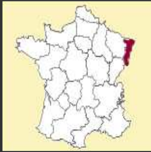
MAP OF FRANCE