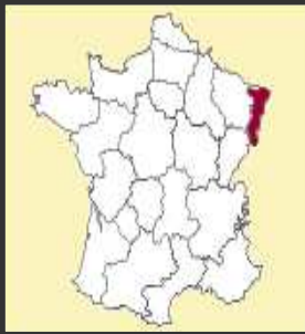
MAP OF FRANCE