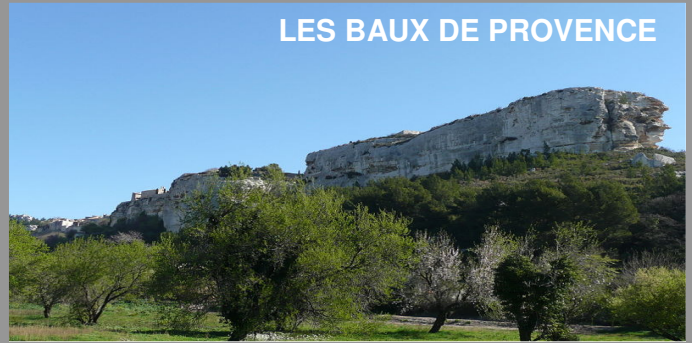
LES BAUX DE PROVENCE