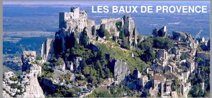
LES BAUX DE PROVENCE