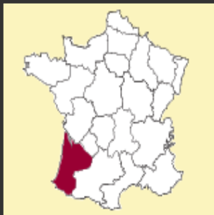
MAP OF FRANCE